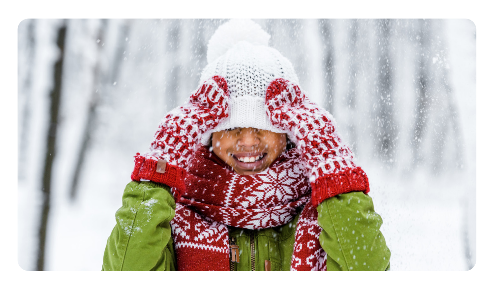
Sometimes it snows in winter.