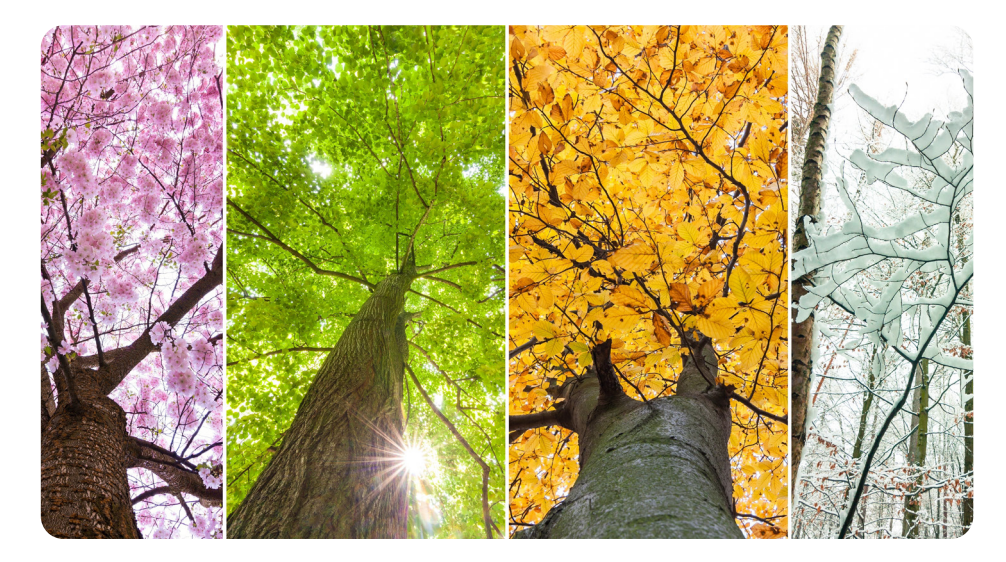
There are four seasons. They are spring, summer, autumn and winter.

Read these interesting facts about winter with a parent, carer or teacher.