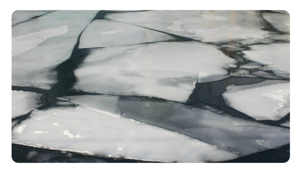
The weather can be very cold in winter and water in puddles and ponds can freeze into ice.