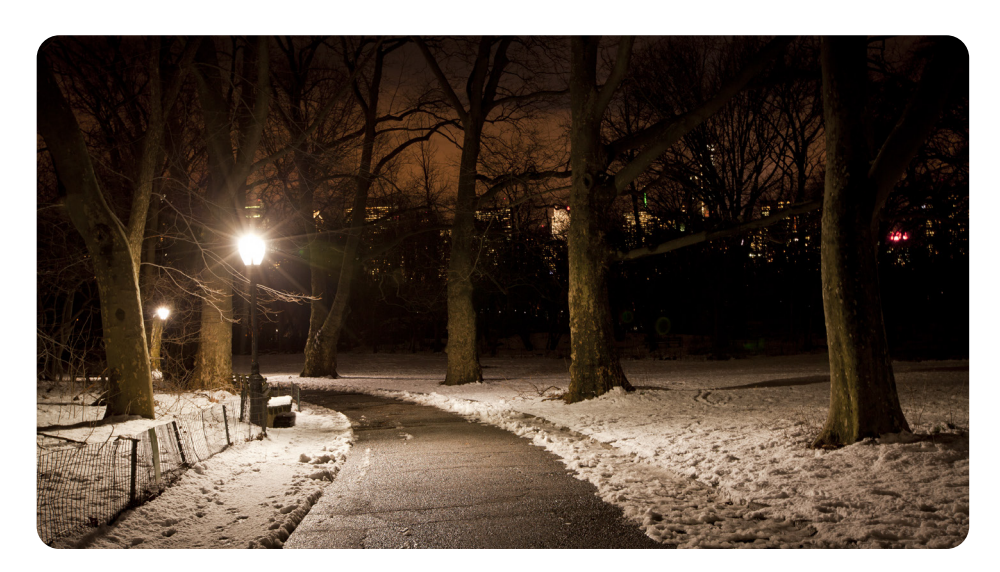
Winter is one of the seasons. In winter, the days are short and the nights are long.