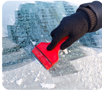
frost on windcreens