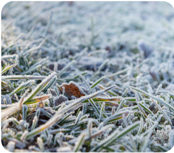
frost on the grass

1. On a cold and frosty day, go on a walk and see if you can spot any of these things.