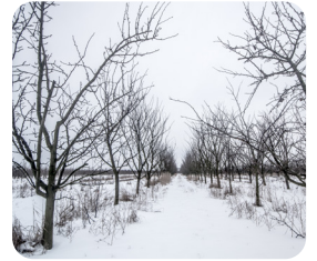
trees with no leaves