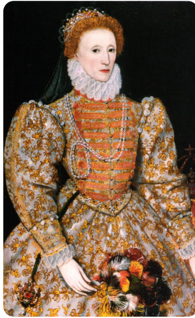
Queen Elizabeth I