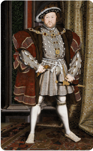
King Henry VIII

6. A long time ago, kings and queens made rules for the country.