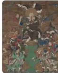
Shangdi surrounded by attendants.

People in the Shang Dynasty worshipped the king of the gods, Shangdi. They also prayed to lesser gods who controlled aspects of the world, such as the sun, wind, rain and moon. People made offerings and sacrifices to please their deceased ancestors. They believed that the soul lived after death, so they buried objects, including ritual vessels containing food and drink, for the dead to use in the afterlife.