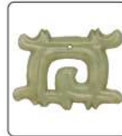
Jade plaque, c3500-c2000 BC

Jade is a hard and rare stone, made from the mineral nephrite, which is difficult to shape and carve. Jade was used for jewellery, ornaments, weapons, tools and ritual objects. It was precious and a symbol of purity and virtue.