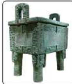
Houmuwu ding from Yinxu

Bronzeworking skills were a major advance during the Shang Dynasty. People learned to smelt copper, tin and lead to make bronze. Skilled craftspeople created vessels that were used for rituals and offerings to the gods. Bronze weapons, such as daggers and spearheads, also gave the Shang Dynasty warriors an advantage over their enemies.