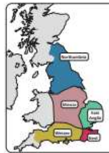
The five English kingdoms cAD 800