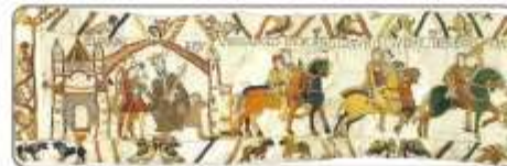
Bayeux tapestry, depicting the Battle of Hastings

When the King of England, Edward the Confessor, died in 1066, he left no successor to the throne. His adviser, Harold Godwinson, was crowned king, but the King of Norway, Harald Hardrada, and William, Duke of Normandy, also claimed the throne. Harold Godwinson defeated Harald Hardrada at the Battle of Stamford Bridge in the north of England and then marched south to fight William, Duke of Normandy at the Battle of Hastings. William, Duke of Normandy won the battle and Harold Godwinson was killed. He was crowned king on Christmas Day in 1066 and became known as William the Conqueror. This was the end of Anglo-Saxon or Viking rule in England.