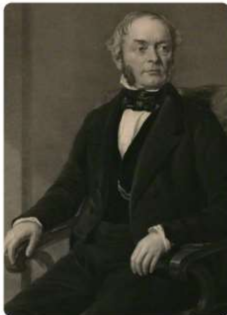
Samuel Wilderspin (1791–1866)

Samuel Wilderspin was a teacher who is known as the founder of infant education. He had enjoyed learning at home and looked forward to going to school. When he started school he didn't like the strict teachers or the boring lessons. He believed that children should enjoy school and be happy. He invented the school playground so children could play outside.