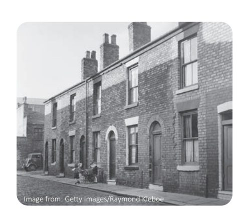
A street in the 1950s.

The way people use land changes over time. For example, in the 1950s there were fewer cars, so fewer roads were needed. Today lots of people have cars, so there are many more roads for people to drive on and driveways for parking.