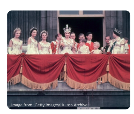
Queen Elizabeth II on her coronation.

A coronation is a ceremony where the crown is placed on the head of the new king or queen. Elizabeth II was the Queen of the United Kingdom for 70 years until she died in 2022. The coronation ceremony of Elizabeth II took place on 2nd June 1953 at Westminster Abbey, London. Many people celebrated the coronation by holding street parties.