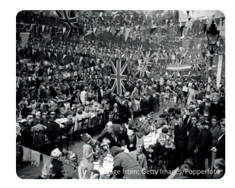
Street party to celebrate the coronation.