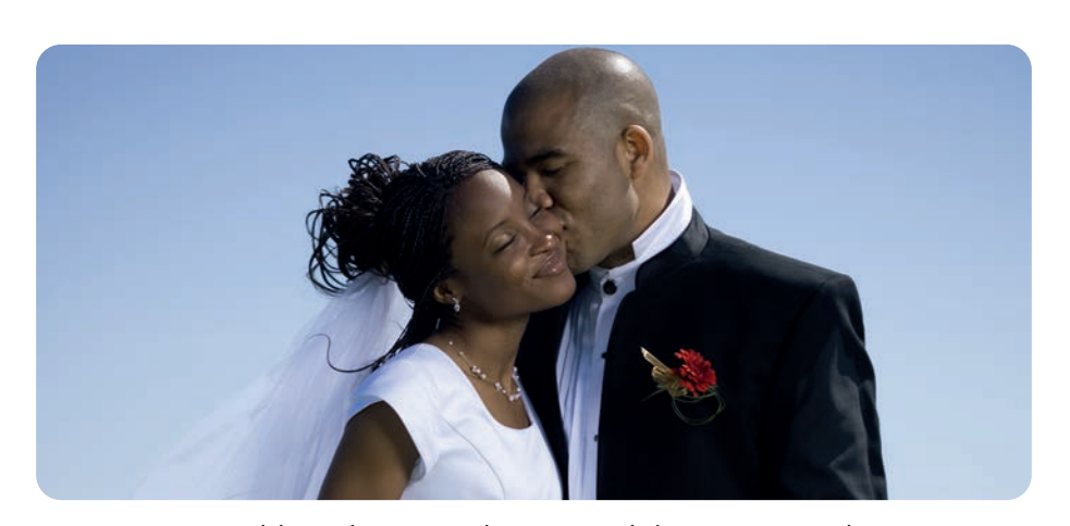
Weddings happen when two adults get married.