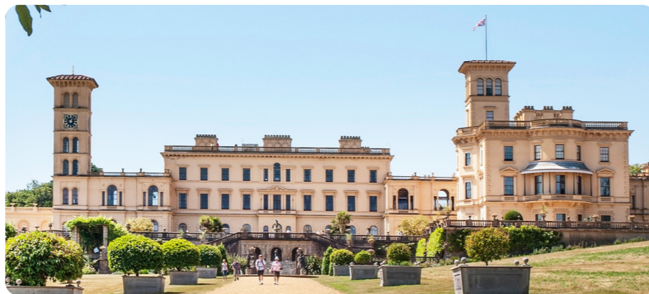
Osborne House is on the Isle of Wight, England.