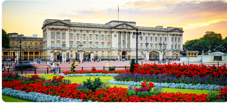
Buckingham Palace is in London, England.

Royal residences include palaces, castles and stately homes. Some of them are used for official royal business. Some are used as holiday or private homes. Many are tourist attractions.