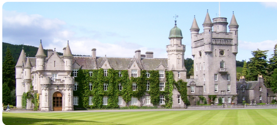
Balmoral Castle is in Aberdeenshire, Scotland.