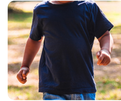
A cotton T-shirt is soft and stretchy.